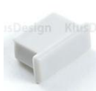
end cap without hole (1059) with hole (1060)