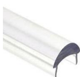
cover type S clear (00220)