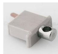
electricity conductive end cap (1443, 42601)