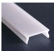
cover type K / KA-BIS frosted (1547/17071) clear (1548/17072) cover type LIGER frosted matte (17031)