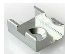
mounting bracket zinc (1072) chrome matt (1345)