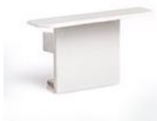
end cap LARKO without hole (24008)