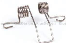
spring KMA (00838)