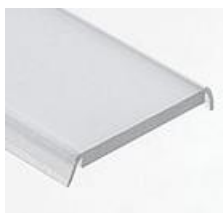
cover type HS22 frosted (17011) clear (17022)