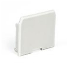
KOZEL end cap without hole (24034)