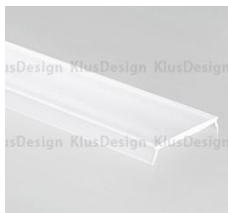
cover type LIGER 22 frosted matte (17032)