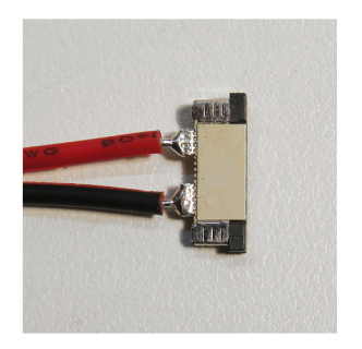
Another view looking down onto the top of Ribbon connector.