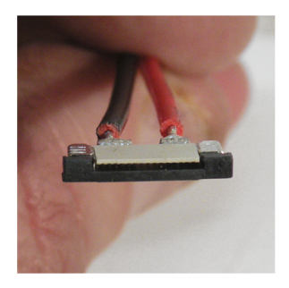
This is the top of the connector. You will place the Ribbon into this slot facing up.