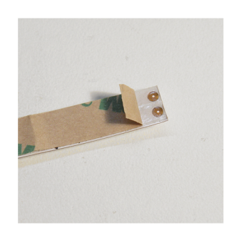
Peel back the backing tape about 1/4 inch.