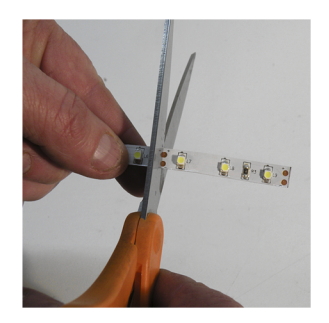
You can cut the ribbon on the line between 4 copper dots. Be sure to cut straight across.