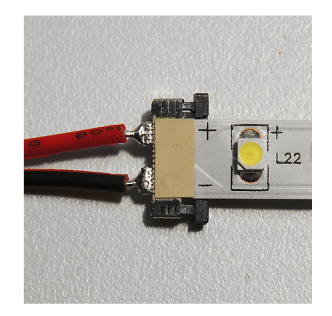
Insert Ribbon into connector, check the wire polarity (red wire to positive) copper dots should not be visible.