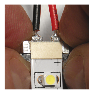
With connector between your 4 fingers, squeeze the black piece closed.