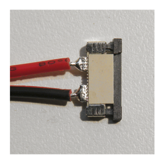
Gently pull out black piece about 1/8 inch.